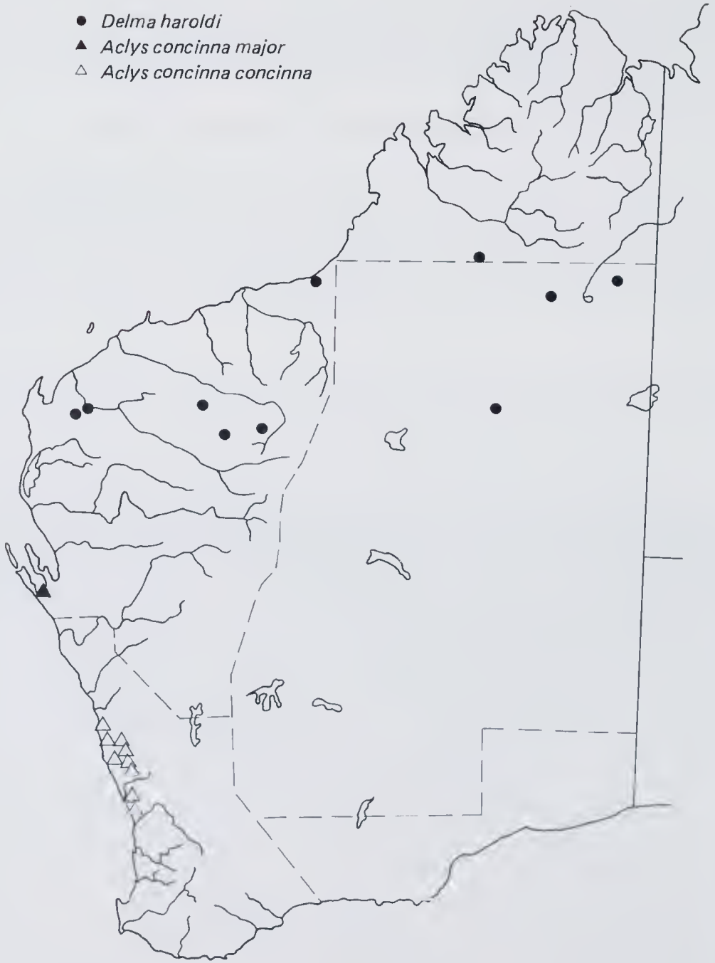
Figure 4 Map of Western Australia, showing location of specimens of Delma haroldi , Aclysinna major and Aclysinna concinna .